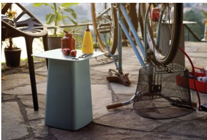
Metal Side Table (Outdoor)

The galvanised Metal Side Tables, optionally powder-coated with a fine surface texture, are weatherproof occasional tables and come in several sizes.