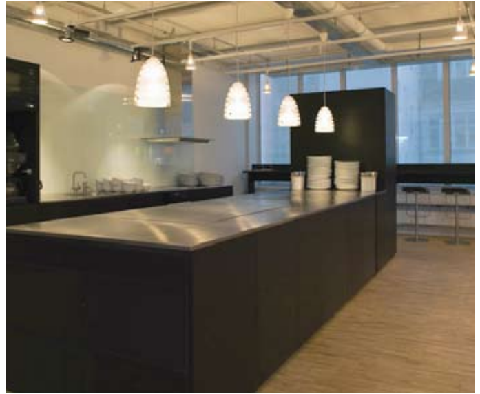
Louis Poulsen Lighting A/S Headquarter. Copenhagen, Denmark. Architect: PLH arkitekter as. Lighting designer: Louis Poulsen Lighting A/S.