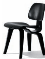
Eames Molded Dining Chair with Wood Legs