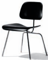
Eames Molded Dining Chair with Metal Legs

Durability—the plywood has five plies, with hardwood inner plies; natural rubber shock mounts absorb movement.