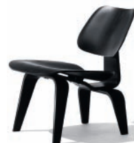
Eames Molded Lounge Chair with Wood Legs