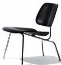
Eames Molded Lounge Chair with Metal Legs