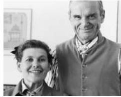
Charles and Ray Eames